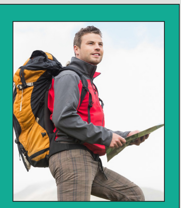
"I live for outdoor adventure, and the mountains have so much to offer."

Age: 35 Occupation: Financial Analyst Income: $97,000/year Location: Charlotte, N.C. Marital Status: Single