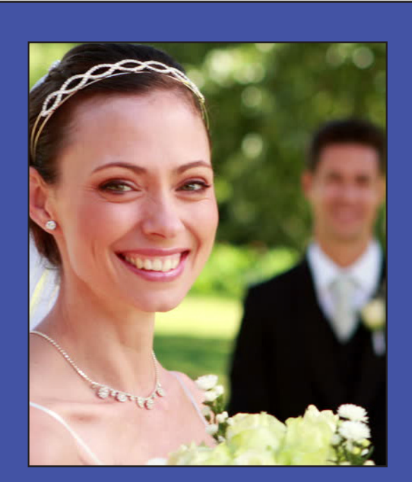
"We're an active couple, so a romantic, mountain getway is the perfect honeymoon."

Occupation: Social Media Specialist Income: $53,000/year Location: Orlando, Fla. Marital Status: Married